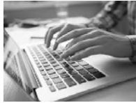
Thesis Papers of the Participants