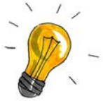
Idea and preparations