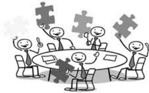
Virtual Workshop: working groups (separate) + final plenary (all)